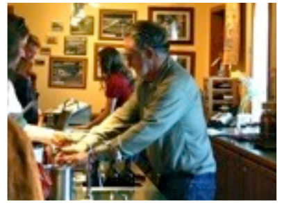
Bonair Winery, five minutes away

In addition, we can arrange other activities for you to take advantage of the many recreational opportunities in season in the Yakima area. Whether you're from out of town or local, it's a great way to try Zillah Lakes on for size and show friends a great time in Wine Country. 1-800-942-2032.