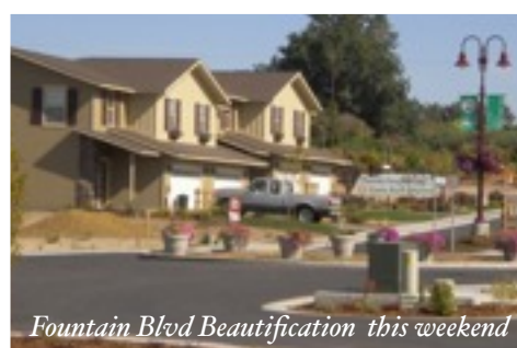
Fountain Blvd Beautification this weekend