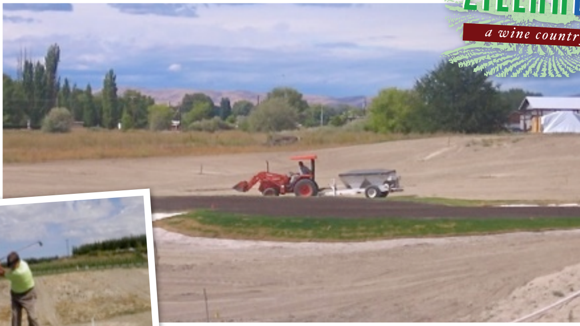
Preparing the Practice Green